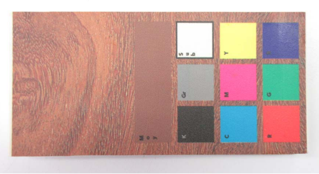
Sample 2 after 2000hrs exposure