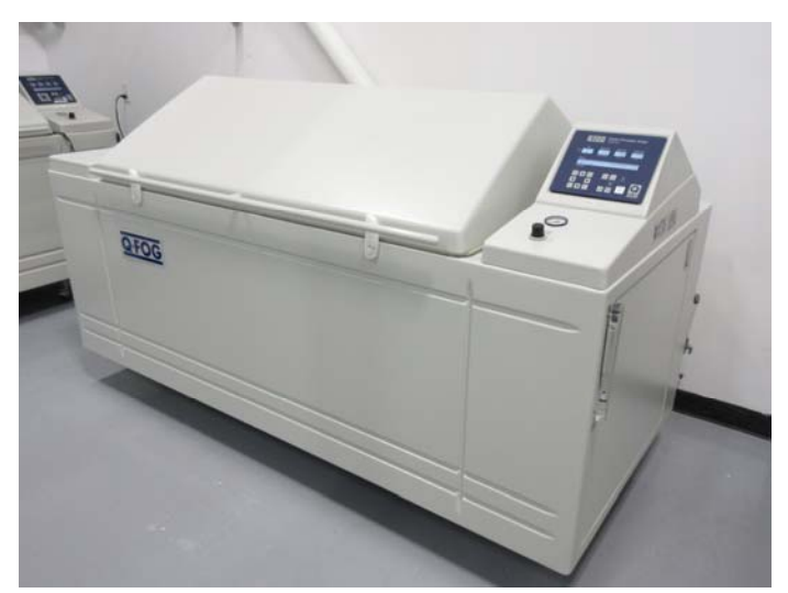
Salt Fog/Spray machine used