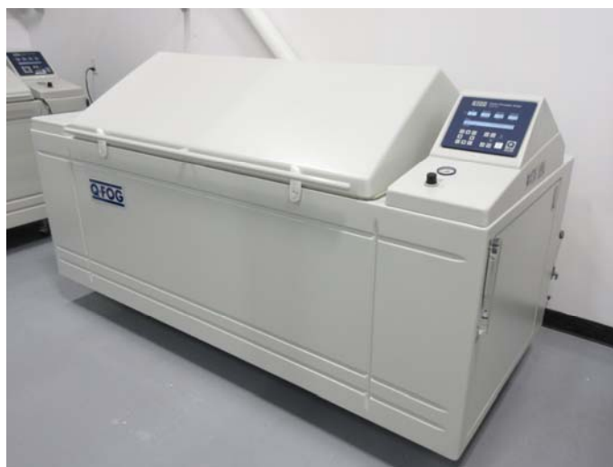
Salt Fog/Spray machine used

This report shall not be reproduced except in full, without the written approval of the laboratory. The results herein relate only to the items tested.